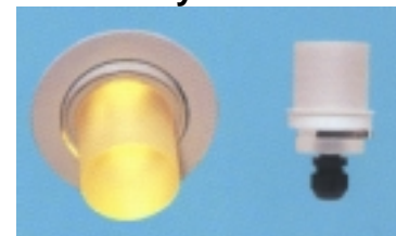
Poly Orn 7