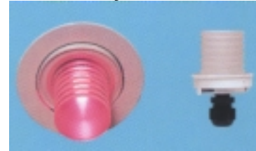
Poly Orn 6