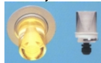
Poly Orn 8