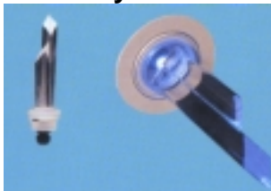
Poly Orn 5