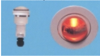
Poly Orn 1