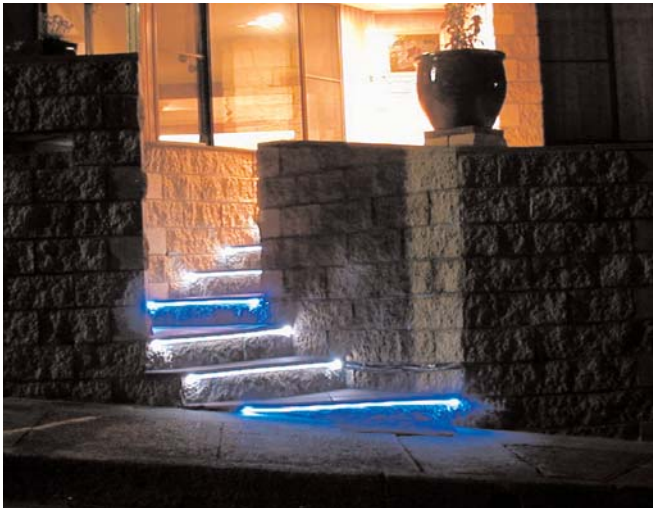
Poly Optics Step and Aisle Lighting

Although power outages don't occur that often, it's essential that when they do happen, your building is properly equipped and can light a path to safety for the people inside. Leading lighting manufacturer Poly Optics Australia is redefining low voltage safety lighting with the introduction of step and aisle lighting. The product has been released as part of Poly Optics' plan to make low voltage safety and emergency lighting more attractive and more readily available. Low voltage LED's are used to illuminate a length of fibre optic cable. The result is an energy efficient, heat free and completely safe product. The product is perfect for applications where safety is paramount. The system has extremely low running costs and