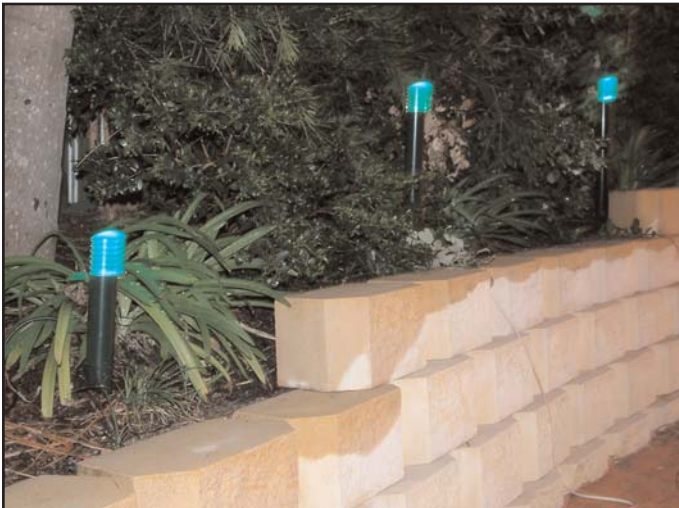
Poly Optics new range of LED garden bollards

When you first turn the lights on for the evening, Poly Optics LED cluster lights will fill your pool and garden with light to suit your mood. You can go from cool tranquil blue to fast colour changing sure to liven up any party. The focus now is on